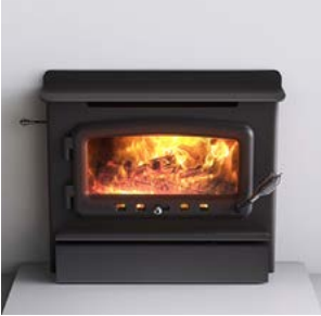
Size: 695(w) x 541(d) x 578(h)