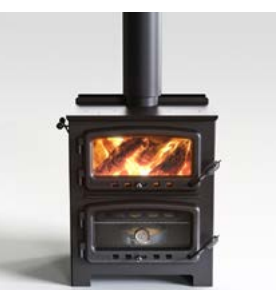
Size: 690(w) x 577(d) x 823(h)