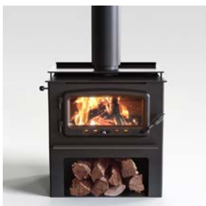
Size: 750(w) x 627(d) x 792(h)