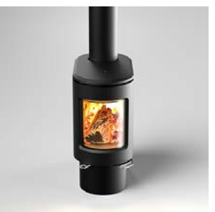
Size: 300(w) x 550(d) x 600(h)