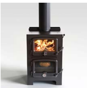
Size: 550(w) x 573(d) x 823(h)