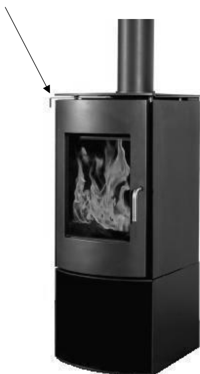
Top air slide handle

This air control allows air to enter the firebox from above the door where it is then drawn down into the base of the fire while keeping the glass clean.